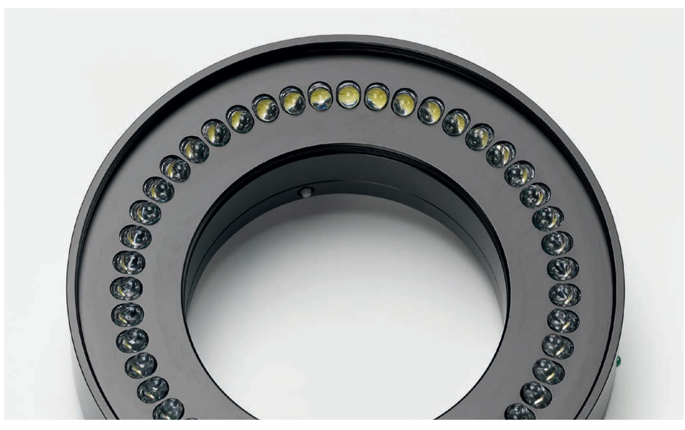
The EasyLED product line integrates advanced LED illumination with control functions in a single compact device. It is the ideal standard illumination system for routine inspections and education.