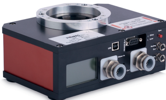
CompactPowerMonitor F-1 with adapter ring