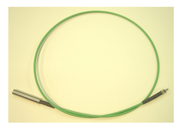
19 Fibers, 200um SMA-905 to 10mm OD Ferrule