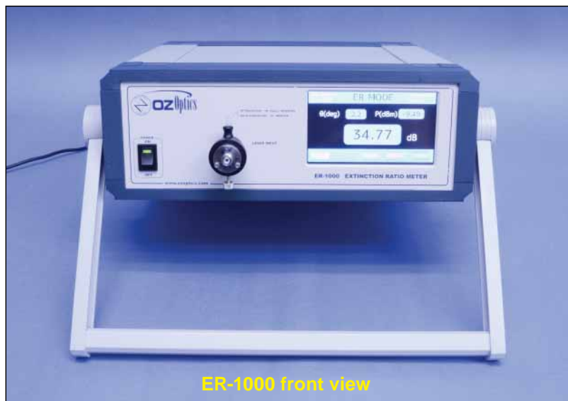
ER-1000 front view

In addition the meter can provide a relative power readout, proportional to the input power in dB. This readout is updated at up to 650 times per second. The computer interface allows the unit to be used with computer control units, for alignment purposes. The combination of polarization and relative power functions allows the unit to be used for complete auto-alignment of polarization maintaining components.