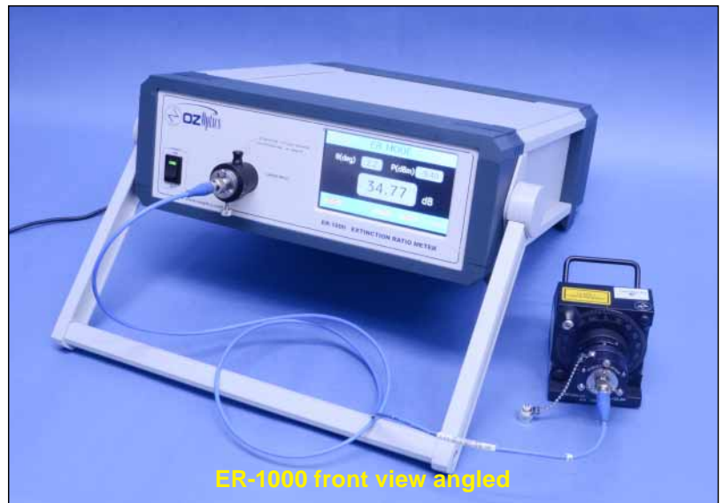
ER-1000 front view angled

The detection circuitry for the ER meter has an overall dynamic range of about 60 dB. When the input signal has a power level within the range of 300 \mu W to 1 mW (a 5 dB range), this leaves at least a 55 dB range for the ER measurement itself. Since the extinction ratio is based on the ratio of two values, a minimum and a maximum, the minimum value may approach the noise floor of the instrument if the extinction ratio is really good or the input power is close to 300 \mu W or below. In such a case, the minimum value may default to the noise floor of the instrument. Under these conditions, the instrument may not be able to provide an accurate reading. However, it will be able to determine a worst case value, which will be indicated to the user as such. By using a higher-powered source, the instrument will be able to provide an improved reading. For example, with a low power signal, the ER meter may indicate that an extinction ratio is >27 dB. If the user needs to know whether the actual value is over 30 dB, then a more powerful source should be used. If the ER meter has an optional attenuator installed, the user could simply remove the attenuator.