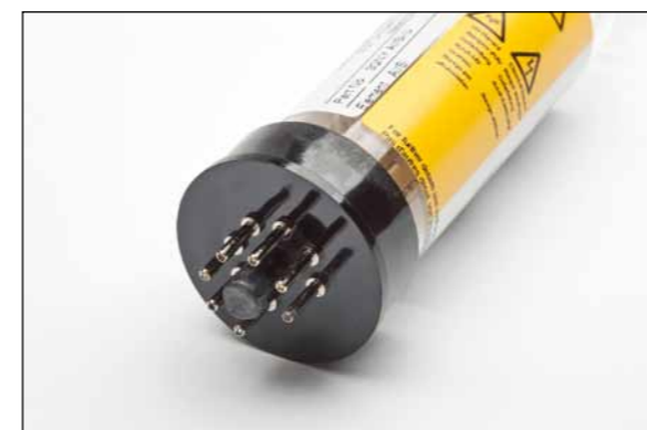
37 mm Thermo Coded

For optimum use of the lamp for its end purpose, chemical analysis, Heraeus aims to provide the best ratio of output : chemical sensitivity : life : noise and stability. The general relationship between these factors demonstrates that lower current gives increased chemical sensitivity but also increased noise levels and decreased output. Higher current will conversely reduce the noise, increase the output but will also reduce the chemical sensitivity. Each element and its matrix presents a unique problem, requiring the analyst to determine the optimal conditions for each particular analysis. The result will inevitably be a compromise in which some output has to be sacrificed in favour of other factors considered more important to the analysis.