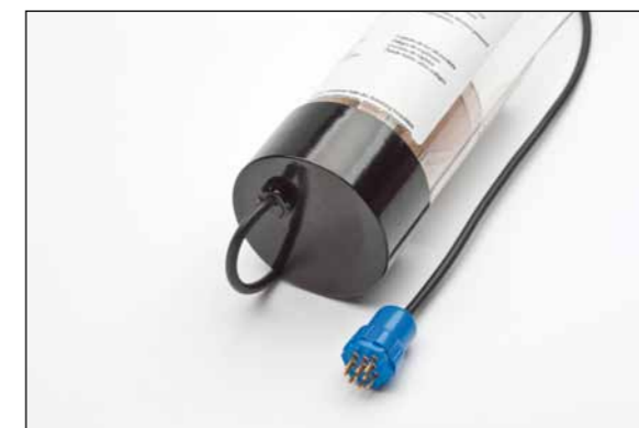
50 mm Standard