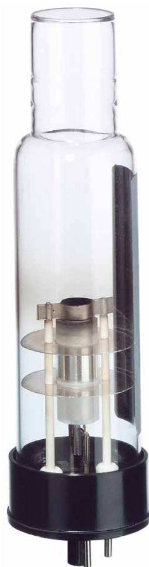
37 mm Hollow Cathode Lamp

Heraeus manufacture and supply a complete range of data coded hollow cathode lamps for Varian, Perkin Elmer and Thermo instruments.