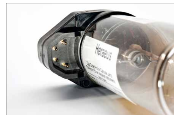
50 mm PE coded Analyst

A variety of base designs is available for Heraeus Hollow Cathode lamps.