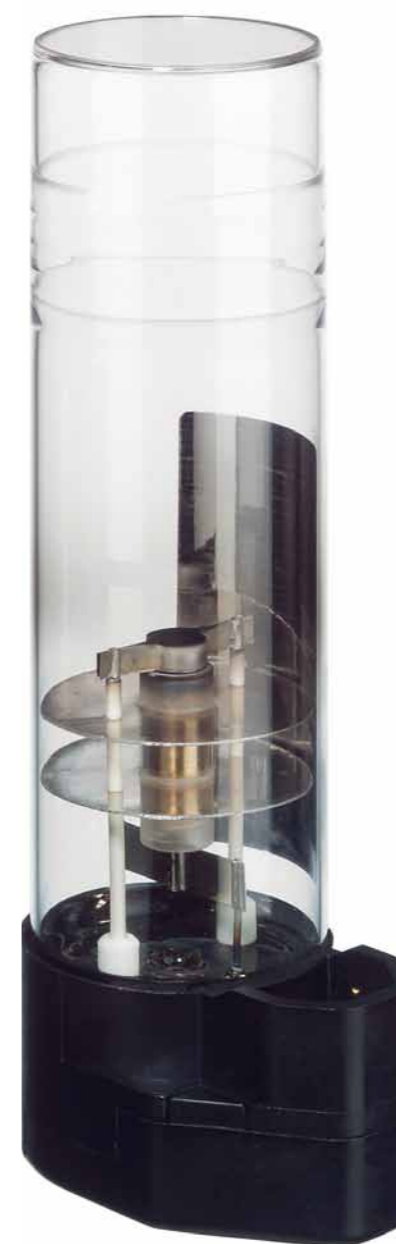
50 mm Hollow Cathode Lamp

Data coded hollow cathode lamps incorporate a unique electronic configuration in the base or plug which the instrument recognizes and sets default operating conditions for the routine analysis of that element. The parameters may be overridden by the operator if desired to suit the specific requirements of the analysis. The electronic configuration of the data coding is also specific to each instrument manufacturer and not interchangeable i.e. a Varian coded lamp will not register in a Thermo instrument. Heraeus offers a full range of coded lamps for each manufacturer, the exact range being governed by the software embedded in the instrument.