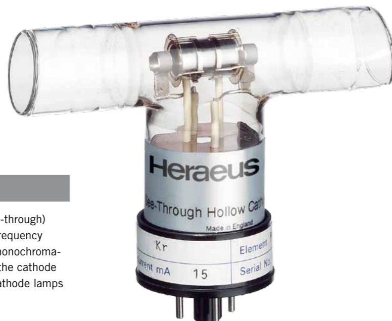
See-Through Hollow Cathode Lamp

Heraeus also manufactures optogalvanic (see-through) hollow cathode lamps, designed to act as a frequency stable reference for high intensity tuneable monochromatic light sources, particularly lasers. Most of the cathode materials used in standard Heraeus hollow cathode lamps may be used in the “see-through” design.