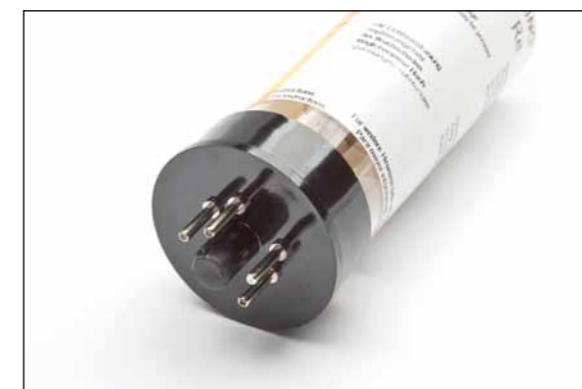
37 mm Varian Coded