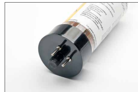
37 mm Standard, 37 mm Self Reversal