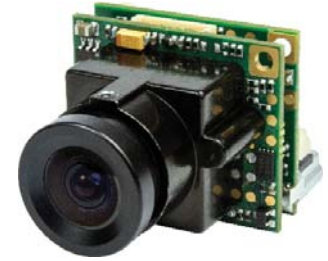
Shown with optional lens