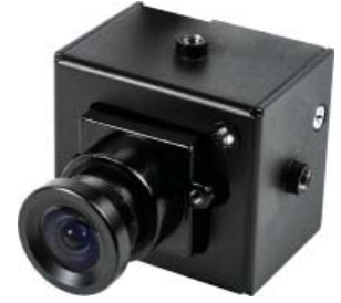
Shown with optional lens