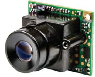
Shown with optional lens