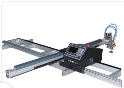
1500*3000mm Small Cnc Plasma Cutter F2100B CNC Plasma Metal