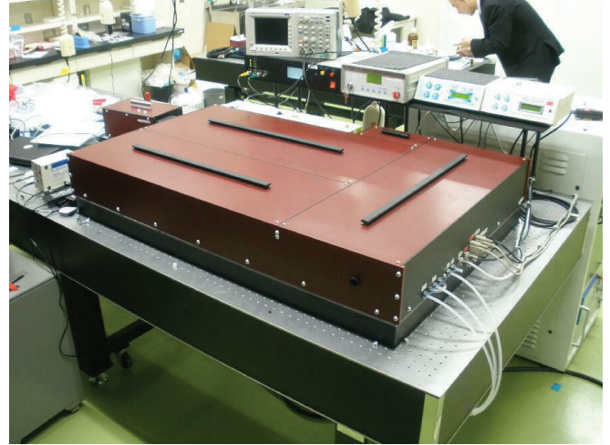
Cr:Forsterite regenerative amplifier FREGAT-200