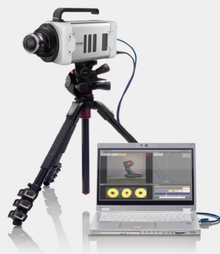
FASTCAM NOVA Model Comparison - Frame Rate

FASTCAM NOVA recording memory can be divided into multiple active sections. The user can record an on-going event in one memory partition while at the same time downloading a previously recorded image sequence in order to improve workflow and optimize camera operation.